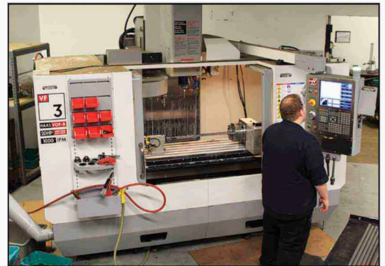
Haas CNC Vertical Milling Machine