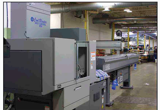
Citizen Swiss Style Screw Machine

Suncor Stainless, Inc. can handle almost any stainless steel parts requirement in long run or short run. We can work with you to design, specify and manufacture complete parts or individual components. Call or click today to learn more about Suncor Stainless and our vast products and services!