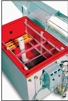
Salt Spray Tester

Suncor performs extensive materials proofing for corrosion resistance, utilizing a sophisticated salt spray (SS) testing process. This places the product under the strain of 10 years of constant ocean water exposure. These machines are rare due to the cost and overhead of operation, but the investment ensures the elimination of undetectable issues before they happen.