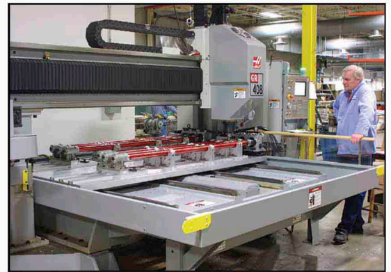
Haas Gantry Router Machine

Only after these tests do we enter the product into our inventory for distribution. Any product sampling that fails a given testing procedure requires extensive retesting of new samples until they are rejected or the issues are resolved. These tests allow Suncor Stainless, Inc. to set the bar for performance quality in the stainless steel manufacturing industry.