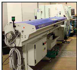
EuroTech CNC Lathe

Suncor has moved aggressively into domestic manufacturing by investing millions of dollars in the past few years. This has given us the ability to respond quickly to customer demand for stock and custom products. We can now produce an almost infinitesimal line of custom parts and prototypes.