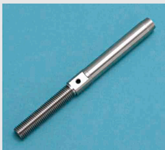
MS21259-Series Swage Stud