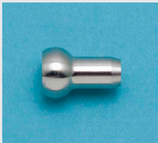
MS20664C-Series Single Shank Ball