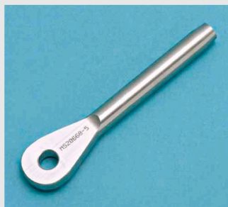
MS20668-Series Swage Eye