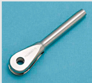
MS20667-Series Swage Fork